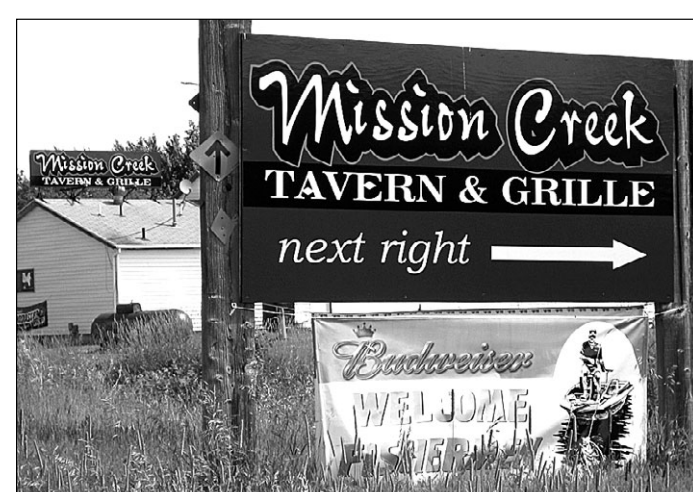
Mission Creek's sign from the highway overlooking the Tavern.

Located just 5 miles north of Pine City in Beroun, 320-629-5537, Owner Greg May. Enjoy something special every night of the week at Mission Creek! Open 7 days a week, the staff invites you to stop by and check them out. Once you've been here, we're sure you'll want to come back.